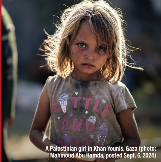
A Palestinian girl in Khan Younis, Gaza (photo: Mahmoud Abu Hamda, posted Sept. 6, 2024)

Call Congress and demand they stop giving Israel American weapons and billions of our tax dollars!