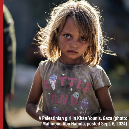
A Palestinian girl in Khan Younis, Gaza (photo: Mahmoud Abu Hamda, posted Sept. 6, 2024)

Call Congress and demand they stop giving Israel American weapons and billions of our tax dollars!