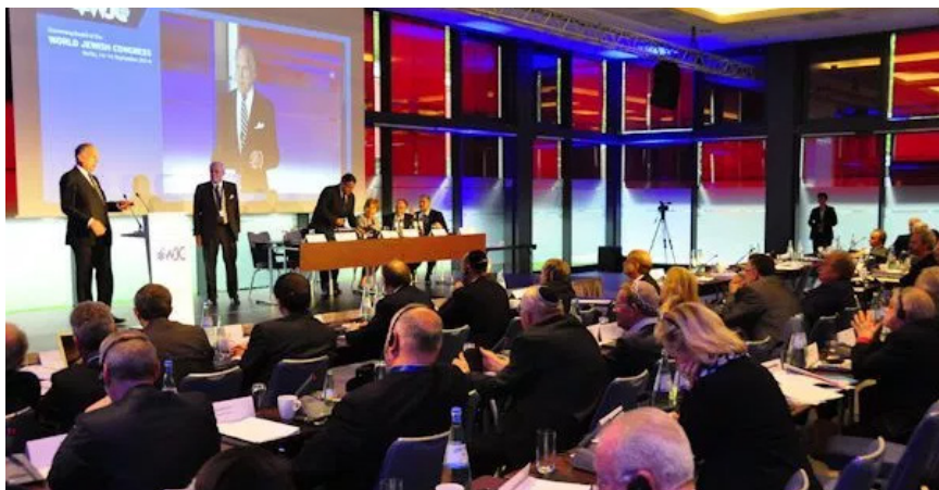
The World Jewish Congress convention 2014, led by Ronald Lauder and chaired by David de Rothschild, urged “all countries to adopt a binding definition of anti-Semitic crimes” based on the Israel-centric definition.