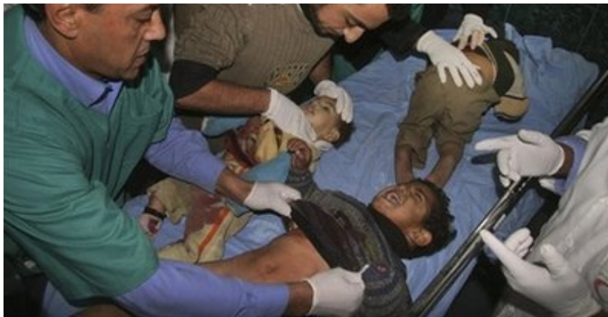
Shifa Hospital, Gaza, 2014