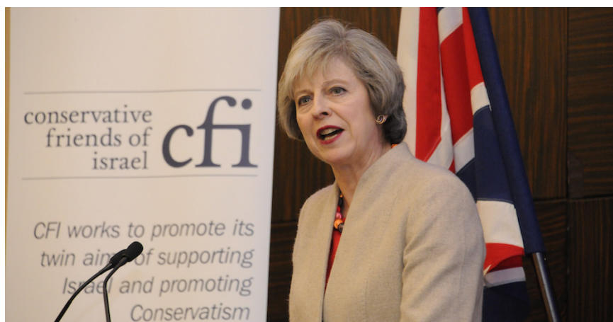
British Prime Minister Theresa May announced the adoption of the Israel-centric definition of antisemitism at a Conservative Friends of Israel event.

UK Prime Minister Theresa May made the announcement during a