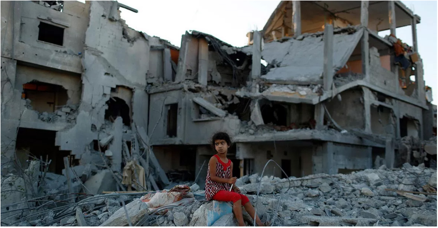
Gaza, 2014. Israel's invasions and shelling of Gaza killed and injured thousands of children and left multitudes homeless.